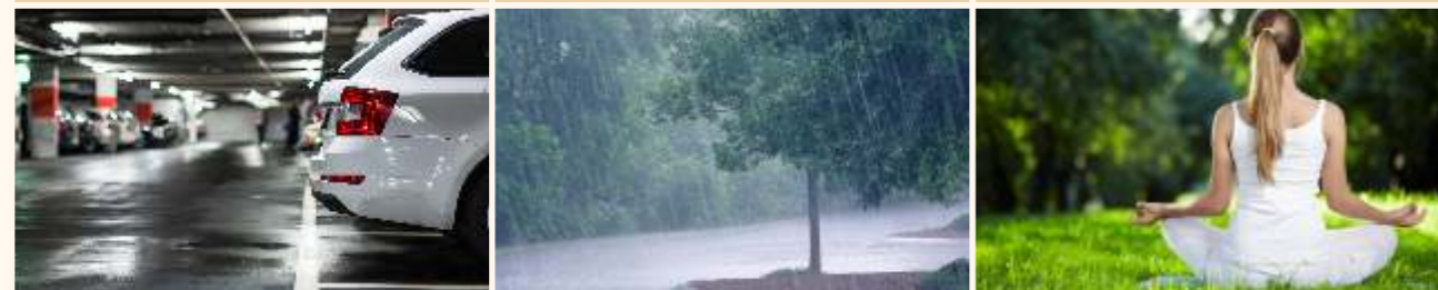
Well-Covered Parking Space