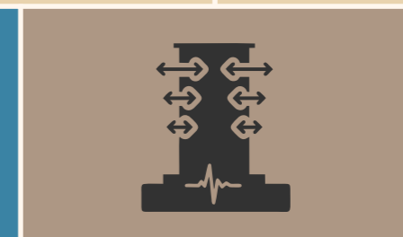
Earthquake-Resistant RCC framed structure