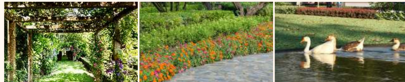
Panoramic Pergola walkways