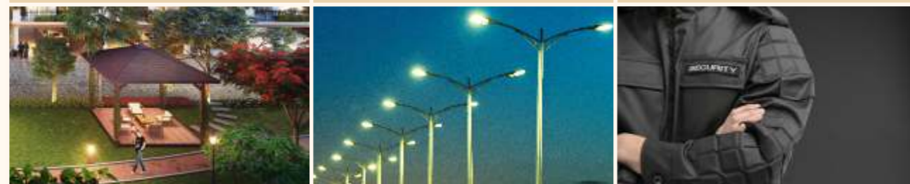
Serene Gazebo Sitting for Elderly