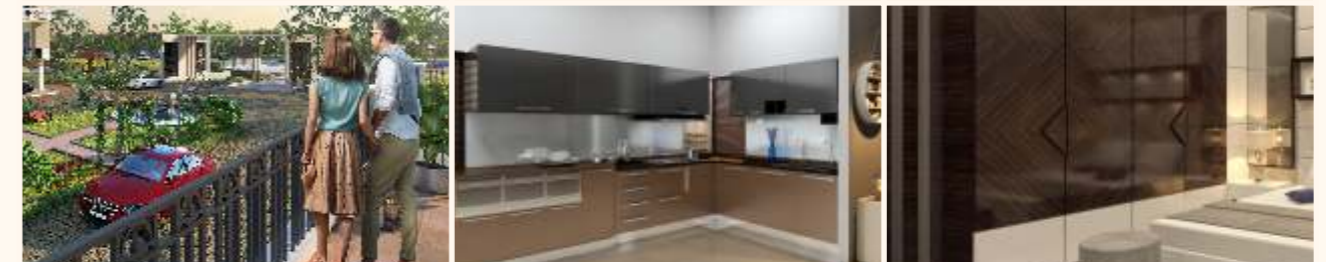
Blissfully Spacious Balconies