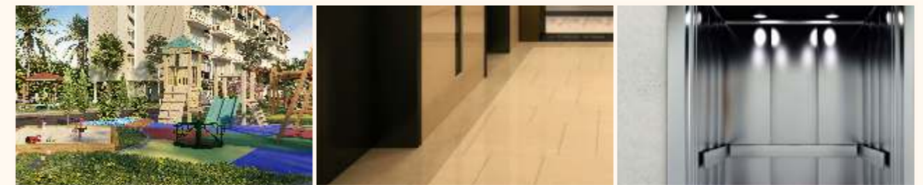
Dedicated kids play area