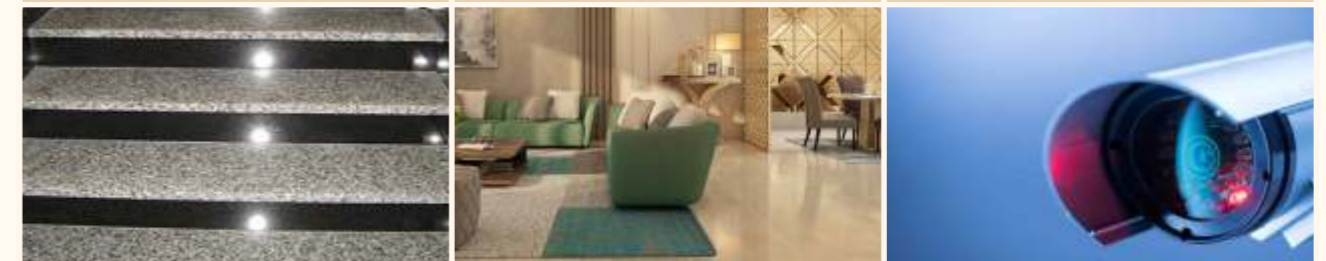
Safe & stylish staircase